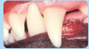
(a) Healthy mouth

Unfortunately once a tooth becomes loose, the problem has usually progressed too far to save that tooth. However if gum problems are identified at an earlier stage, a combination of a Scale and Polish and ongoing Home Care can make a real difference to your pet's oral health (and also their breath!). Please contact us today for further details!